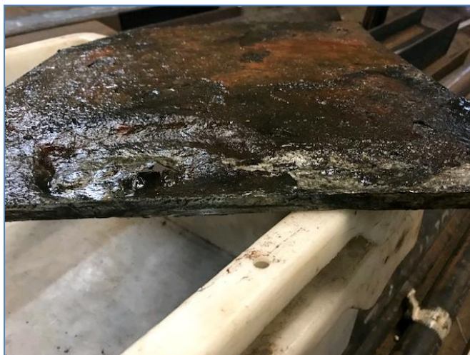
Surrounding plate thickness